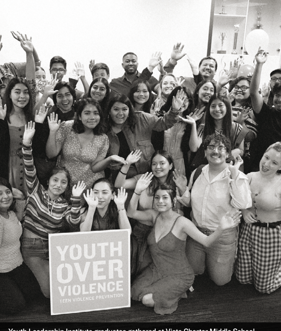
Youth Leadership Institute graduates gathered at Vista Charter Middle School to receive diplomas and give presentations and performances from their specialized internship tracks.